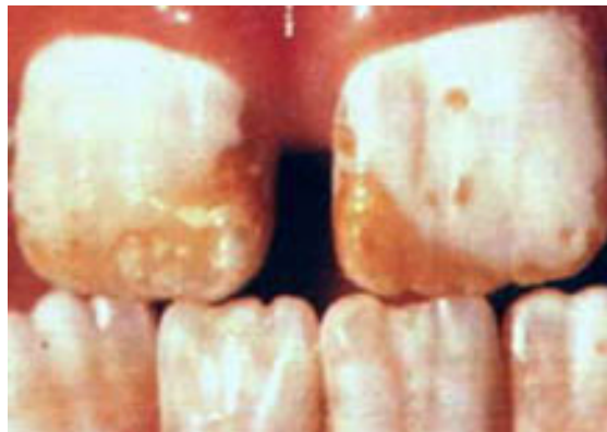
Figure 1: Severe dental fluorosis with discolouration and pitting -- 9 year old boy.

One manifestation of fluoride toxicity is the high prevalence of dental fluorosis . This is not simply a cosmetic effect, as apologists for water fluoridation like to say. In the more severe forms, dental fluorosis involves damage to tooth enamel and tooth function. In artificially fluoridated regions, dental fluorosis is now much more prevalent and severe than the initial proponents of fluoridation predicted. The University of York's Fluoridation Review 2 estimates that up to 48% of children in fluoridated areas have some form of dental fluorosis. To reduce this to the original target of 10% of the population with so-called 'mild' dental fluorosis, we would have to terminate fluoridation.